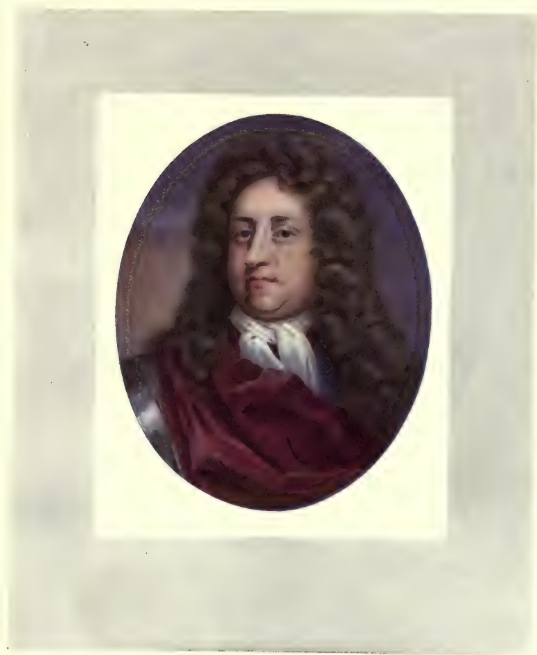
GEORGE, PRINCE OF DENMARK BY CHRISTIAN RICHTER